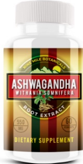
Ashwagandha $7.50 PER UNIT SKU: N60CAS