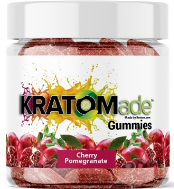
Cherry Pom SKU: KGCP