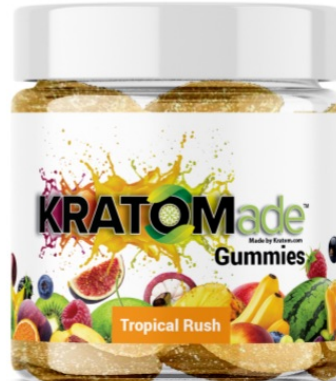
Tropical Rush SKU: KGTR