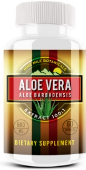
Aloe Vera $10.00 PER UNIT SKU: N60AL