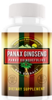
Panax Ginseng $15.00 PER UNIT SKU: N60PG