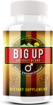
Big Up $7.50 PER UNIT SKU: N60BU