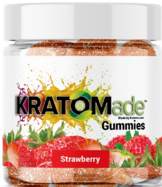
Strawberry SKU: KGS