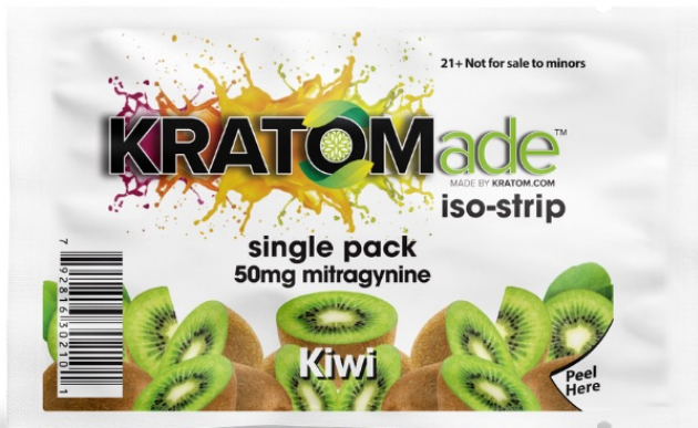
Kiwi SKU: KKD