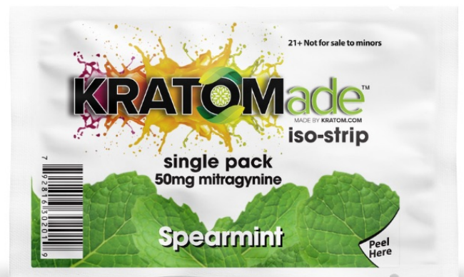
Spearmint SKU: KSD