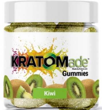
Kiwi SKU: KGK