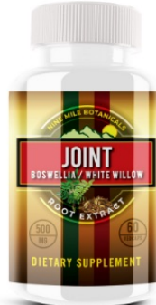
Joint Complex $7.50 PER UNIT SKU: N60JC