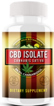
CBD Isolate $10.00 PER UNIT SKU: N60CB