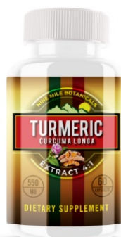
Turmeric $10.00 PER UNIT SKU: N60TE