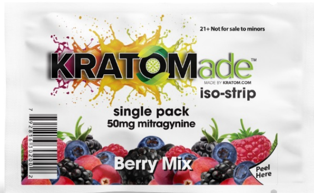
Berry Mix SKU: KBD