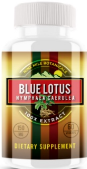
Blue Lotus $10.00 PER UNIT SKU: N60CBL