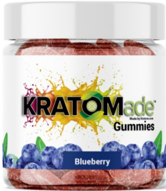
Blueberry SKU: KGBB