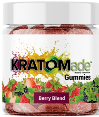
Berry Blend SKU: KGB