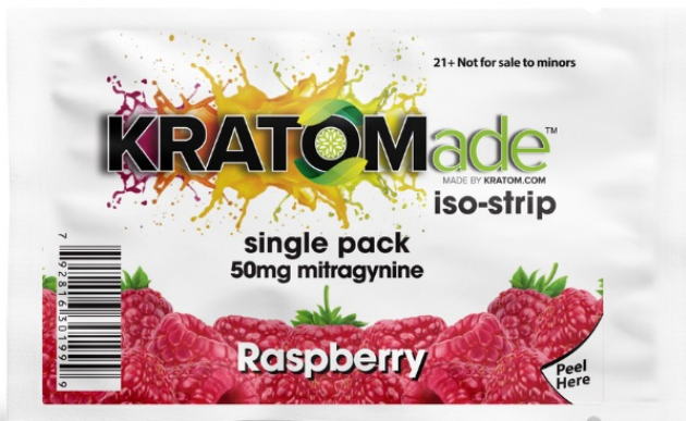
Raspberry SKU: KRD