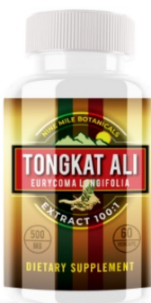
Tongkat Ali $10.00 PER UNIT SKU: N60TA