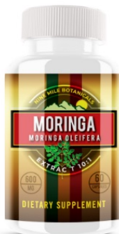
Moringa $10.00 PER UNIT SKU: N60ME