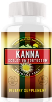
Kanna $10.00 PER UNIT SKU: N60KE