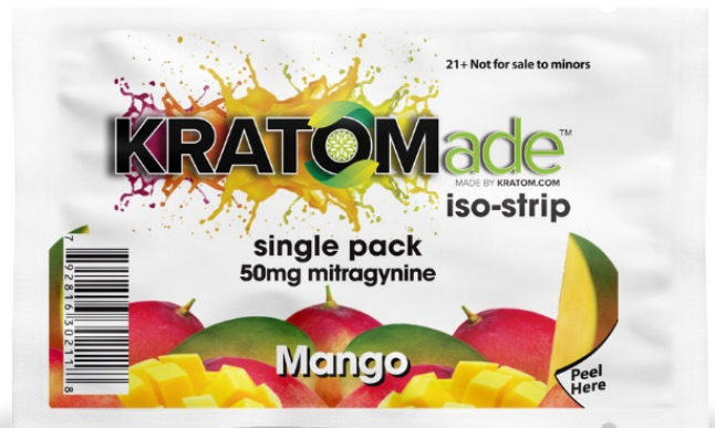
Mango SKU: KMD