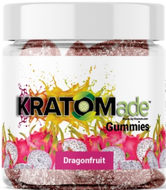
Dragon Fruit SKU: KGDF