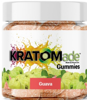
Guava SKU: KGG