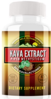
Kava Extract $10.00 PER UNIT SKU: N45KV